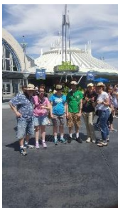
The family visiting Disney World this past April